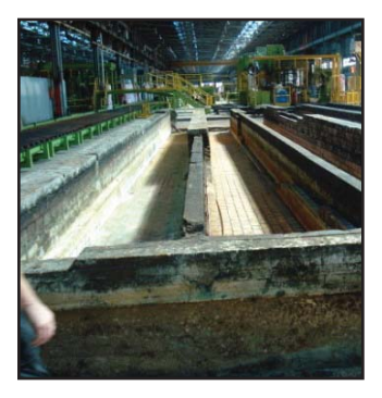
Copper Tube Manufacturer

Provided the South Carolina Budget and Control Board with long-term care site model evaluation of the disposal facility. Work included 100-year closure period extended care cost development; comparative analysis for other currently operating, closed, or planned disposal facilities; and alternative financing and implementation scenarios for closure. Findings were presented to South Carolina's Nuclear Advisory Commission.