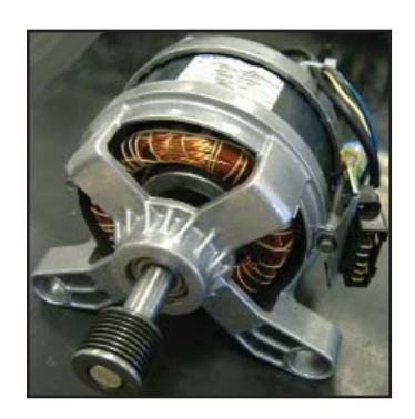
Electrical Motor Manufacturer

A Client was considering purchasing a 165-acre former copper tubing facility with confirmed chlorinated solvents and petroleum products in the subsurface. BBJ Group identified a remedial approach to address the impacted areas and provided an Opinion of Cost to remediate the property, allowing the Client to evaluate options for potential future beneficial reuse for industrial purposes.