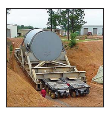
Extended Care Fund Low Level Radioactive Waste Facility

Provided the South Carolina Budget and Control Board with long-term care site model evaluation of the disposal facility. Work included 100-year closure period extended care cost development; comparative analysis for other currently operating, closed, or planned disposal facilities; and alternative financing and implementation scenarios for closure. Findings were presented to South Carolina's Nuclear Advisory Commission.